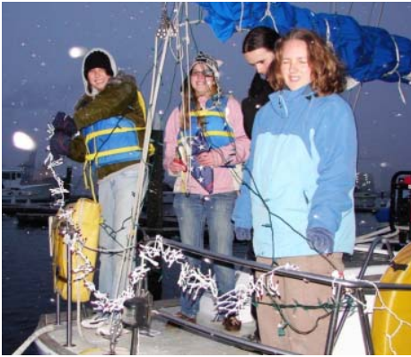
Decorating in the Snow