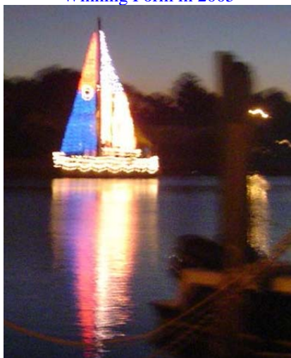
Winning Form in 2005

museum and shopping in St. Michaels. Other ports or anchorages she has visited in 2008 include Dobbins Island on the Magothy River, Galesville, Tangier Island, Crisfield, St. Mary's City, Solomons Island, and Chestertown.